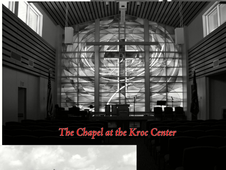
The Chapel at the Kroc Center